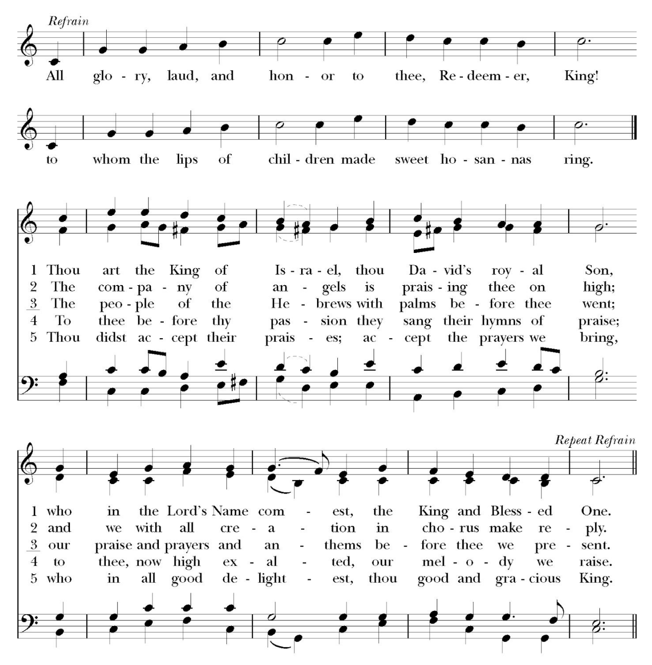
The stanzas may be sung by choir alone or alternately by contrasted groups; all sing the refrain.

Words: Theodulph of Orleans (d. 821); tr. John Mason Neale (1818-1866), alt.