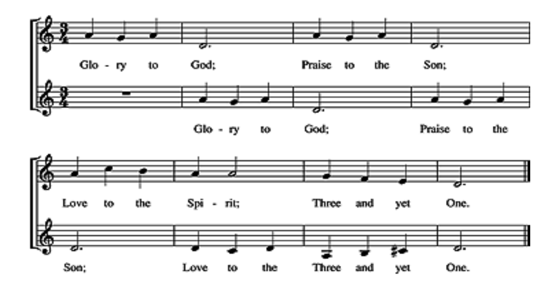
Song of Praise ( Please remain standing to sing )