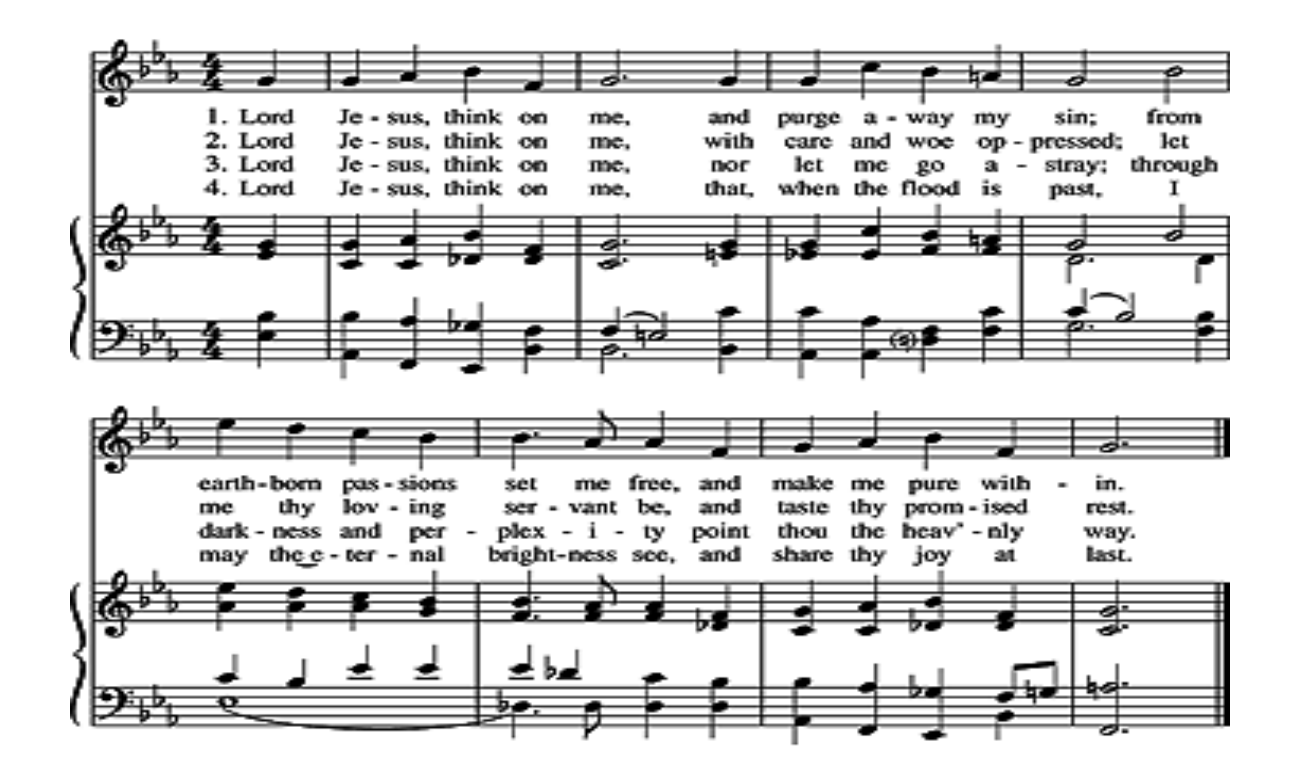
Post Communion Prayer (Please kneel or stand)